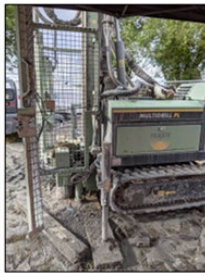
Safety cage enclosing wire winch rope