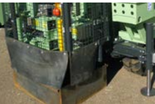
Above: Rubber infill used to extend guard down and accomodate flush system.