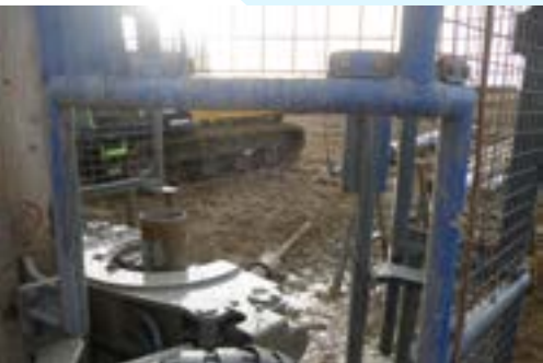
Above: Large, unnecessary gap that permits access to dangerous parts.

Based on the findings on the most frequently logged non-conformances, the BDA is keen to provide further, specific guidance to its members in order to ensure greater adherence to industry Standards and regulations. Below is guidance on rotary guarding, certification for Thorough Examinations and Factors of Safety for wire ropes.