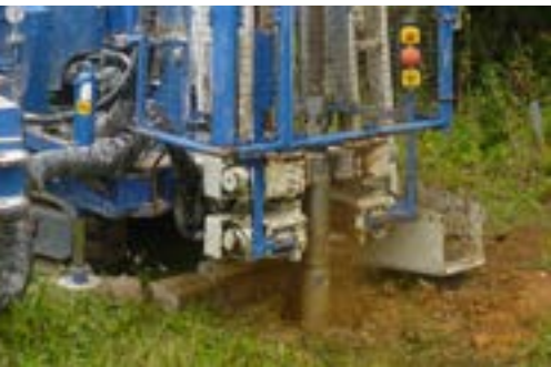
Above: Due to machine setup, guard starts more than 500mm from floor. Either adjust setup, or extend guard.