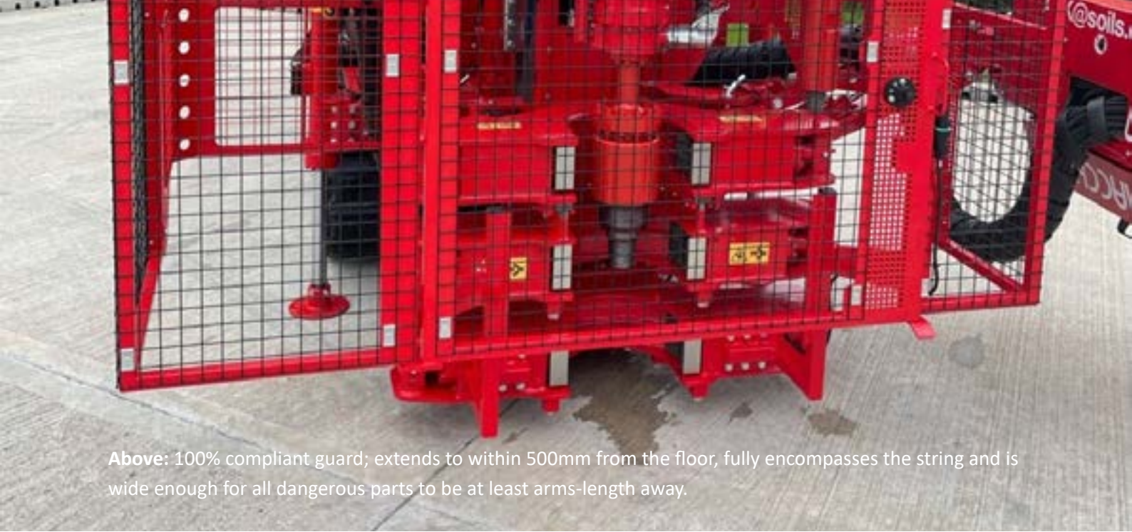
Above: 100% compliant guard; extends to within 500mm from the floor, fully encompasses the string and is wide enough for all dangerous parts to be at least arms-length away.

Below is the decision-making flowchart that BDA auditors work to when determining if guarding is compliant with audit requirements.